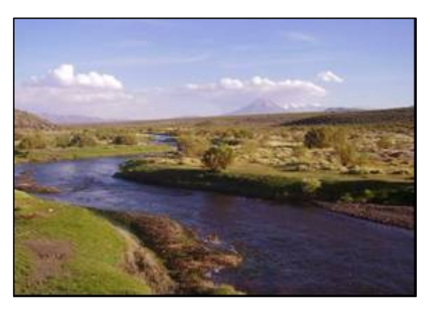
Figure 4. Site 1; National Park Volcán Figure 5. Site 1; National Reserve Isluga (alt. 3776 m asl.).

Site 1 in the far north (19 – 21 ^{\circ} S, 68 – 71 ^{\circ} W) and site 5 in the south (45 – 50 ^{\circ} S, 71 - 74 °W) were surveyed during Y1. Site 1 is just north of the Tropic of Capricorn and is on the periphery of the Atacama desert (one of the driest areas in the world). This site is the only part of Chile containing a section of the Andean plateau or Altiplano. Rainfall in the Altiplano is relatively high and forms a number of saline lakes. Water can feed from these high altitudes down the Andes. A great deal of water is lost by evaporation, however some does form oases or accumulates in subterranean Oases permit the cultivation of tropical fruits and a large variety of vegetables in this region. Forests of the native tamarugos tree have also established in some of the driest regions as these trees are adapted to collect moisture from deep aquifers. The 201 soil samples collected throughout this region are presently being processed at INIA. These samples were collected during Q4 and require a further 1-2 months to fully process. However, a number of potential epf and epn isolates have already been found.