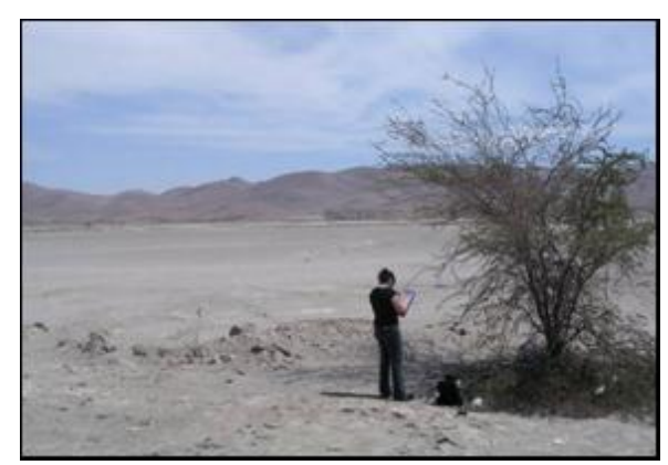
Pampa del Tamaruga (alt. 1100 asl.).

Site 5 is a mountainous region and one of the rainiest parts of Chile, possibly one of the rainiest in South America. Puerto Aisén, a base for the survey in this site, receives around 120" of rain per year, spread evenly from Jan - Dec. The climate is also relatively cold, average summer temperatures at sea level are generally below 15 °C. Forests and livestock pastures predominate within this area. During the survey carried out in Q2, 184 soil samples were collected by the project team. The samples have been processed at INIA and revealed 67 isolates of epf (Metarhizium and Beauveria spp.) and 12 isolates of epn (Steinernema spp.).